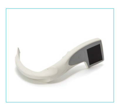
Airway Management • Airway Accessories